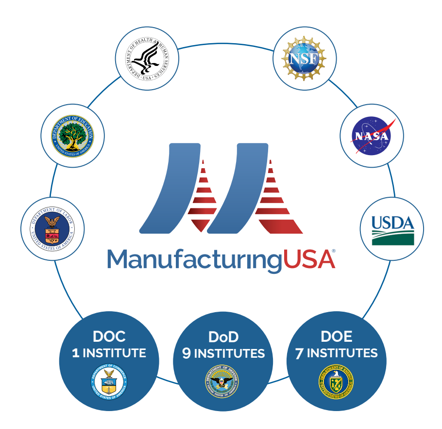
Figure 1. Manufacturing USA partner agencies.

Manufacturing USA Program comprises nine Federal partner agencies: DOC, DoD, and DOE (as sponsoring agencies); and DOL, ED, HHS/FDA, NASA, NSF, and USDA (as participating agencies). Together, the interagency team shares information and approaches to address manufacturing challenges and identify opportunities for collaboration. AMNPO is responsible for coordinating and collaborating with the Federal agencies to conduct program activities.