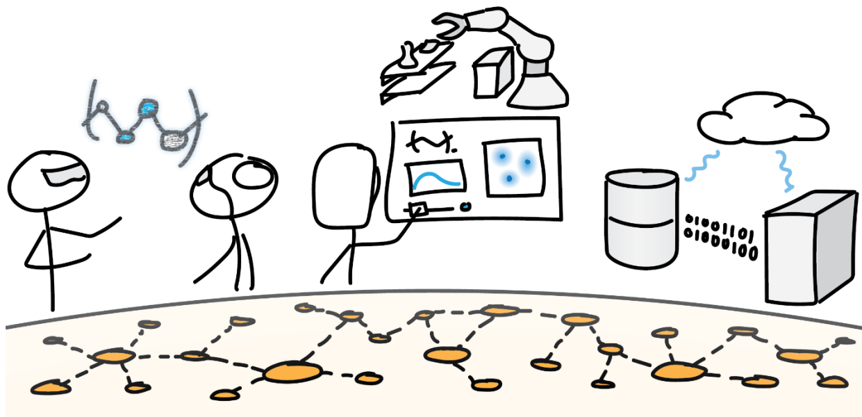
Figure 2: Networks and interfaces as catalysts for polymer materials innovation. Combining the mutual skills and capabilities of humans and machines requires attention to the networks formed between humans and machines, as well as improvements of their various interfaces (i.e., human–human, human–machine, and machine–machine), in order to translate research discoveries into lasting societal benefits.