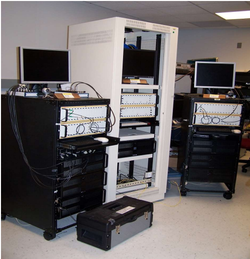
Fig. 1. An active QKD testbed consisting of one ‘Alice’ node (white rack in center) and two ‘Bob’ nodes (black racks on right and left).

(QKD) protocol based on polarization encoded BB84 was implemented with the highest reported sifted key rates over both free-space and fiber [2-6]. This system included custom data handling circuit boards and optimized clock recovery techniques [7] to achieve the orders of magnitude improvement in sifted-key rates for line-of-sight free-space QKD. The rates were capped only by the dead-time of the single photon detectors available [8]. Both differential phase shift [9] and detection-time-bin-shift [10] QKD systems were implemented to overcome the detector dead-time rate cap to further increase data rates. Novel polarization drift recovery and auto-compensation schemes were developed to implement polarization encoded QKD protocols over optical fibers [11]. These high data rate QKD schemes paved the way for a practical one-time-pad encrypted surveillance video demonstration which included a specially designed QKD infrastructure protocol stack as well as a quantum network manager consisting of classical and quantum experimental control planes, which are essential for quantum networks [12]. The first known active multi-node QKD network (figure 1) using an optical switch to dynamically reconfigure the communication channels between a single ‘Alice’ node and a pair of ‘Bob’ nodes was implemented and used to study the performance of the optical switch as well as the polarization recovery and timing resynchronization schemes required after switching [12, 13].