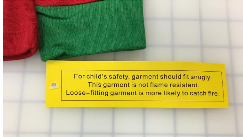
Figure 2 – Tight-fitting sleepwear must bear a specific hangtag bearing no other information or have a label on the packaging.

For more detailed information, see CPSC's: Sleepwear Policy and Loungewear Position Letter , Flammability of Children's Sleepwear Test Manual , and Children's Sleepwear Regulations .