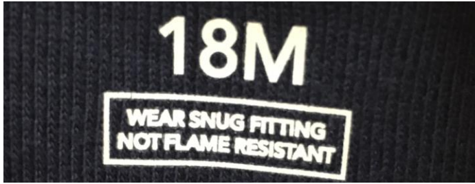
Figure 1 – Tight-fitting sleepwear must also bear a label immediately below the size designation on the front of the sizing label located on the center back of the garment.