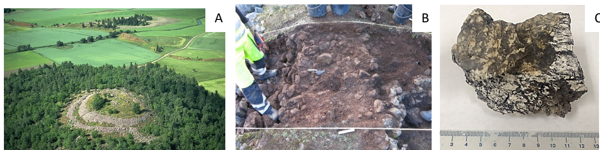
Figure 1. A) An arial view of Broborg. B) Excavation at Broborg, Fall 2017. C) Specimen of vitrified material analyzed in this study.