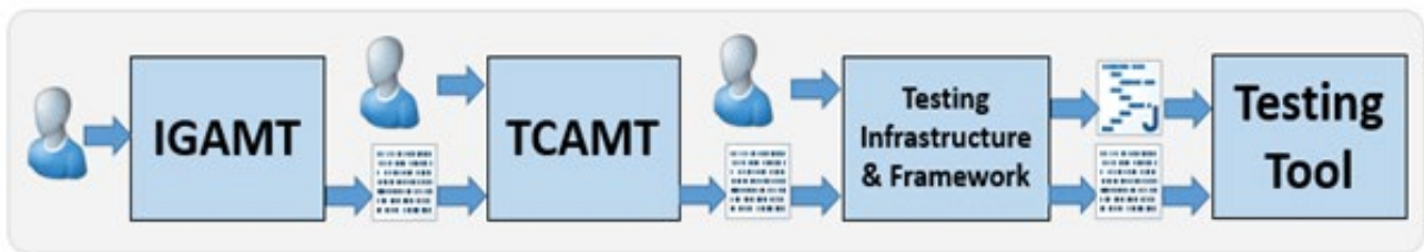
Figure 1: NIST HL7 v2 standards development and testing platform overview.

A profile component represents a subset of requirements that can be combined with other profiling building blocks. One such example is the definition of a profile for submitting immunizations. The Centers for Disease and Control and Prevention (CDC)