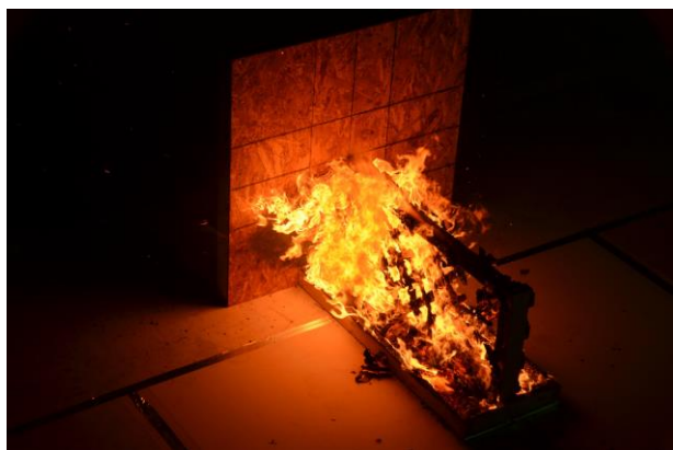
Figure 2 Top - onset of flaming ignition in the mulch bed; bottom - flame spread from the ignited fencing assembly to wall (6 m/s).

In all experiments, the wall was eventually ignited by fire from the redwood lattice fencing