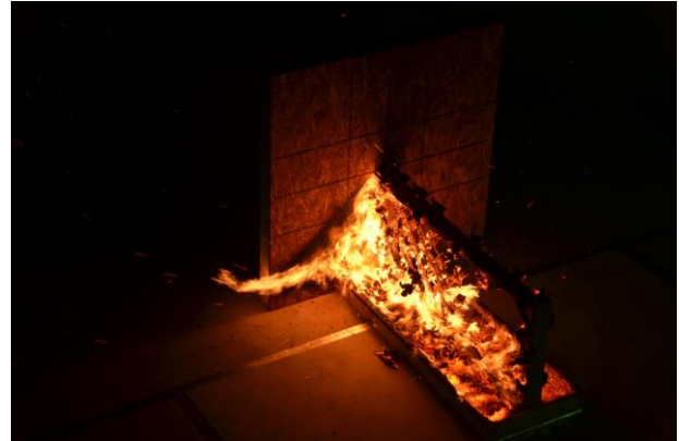
Figure 3 Flame spread from the ignited fencing assembly to wall for 9 m/s wind speed.

This paper describes efforts to investigate the ability of firebrand showers to ignite fencing assemblies, and then observe the subsequent flame spread along the ignited assembly to an adjacent wall.