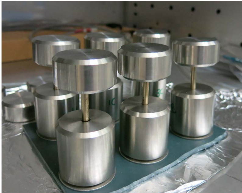
Figure 1: Sampling apparatus for passive sampling of DEHP emission from vinyl flooring.

Methodology: Three to six Tenax thermal desorption tubes were placed vertically on a sample of vinyl flooring for 16 to 24 hours (Figure 1). The Tenax in the tubes was located 15 mm from the end of the tube contacting the vinyl floor material. The tubes were held with adaptors based on designs in Wu et al. (2016). The tested vinyl flooring sample was the same as that tested in Wu et al. (2016).