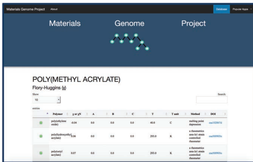
Figure 3: Screenshot of the \chi DB Digital Handbook

second compound (polymer or solvent) involved in the interaction, the measurement method used (where available), the temperature at which the parameter was measured (in various forms), and a link to the original publication. Rows can also be expanded to show additional metadata such as molecular masses and concentration. Figure 3 shows an example of \chi values for poly(methyl acrylate) in the Digital Handbook.