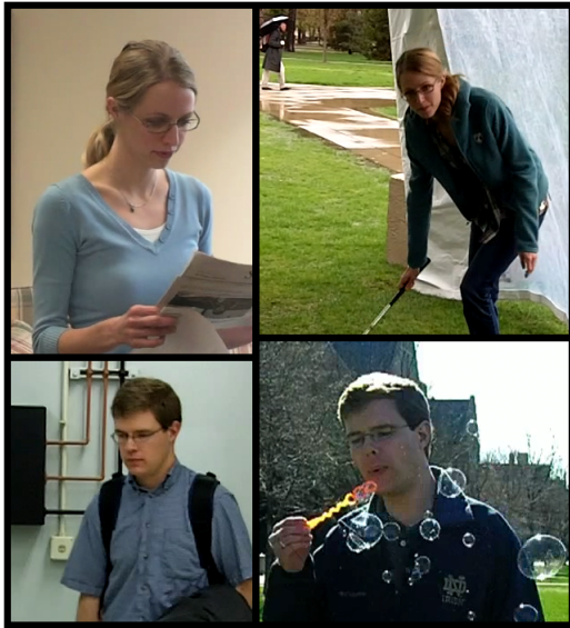
Fig. 1. Clips of two people sampled from four PaSC handheld videos: files 06599d91.mp4, 06599d451.mp4, 05450d1359.mp4 and 05450d1759.mp4.

covariates are reported for each participant. The covariates include properties of the faces such as size, the locations and sensors used to acquire videos, and properties of the subjects such as gender and race. The dominant factor influencing performance is the combination of locations, actions and sensors, indicating verification rates more than double when going from the most to the least challenging environments.