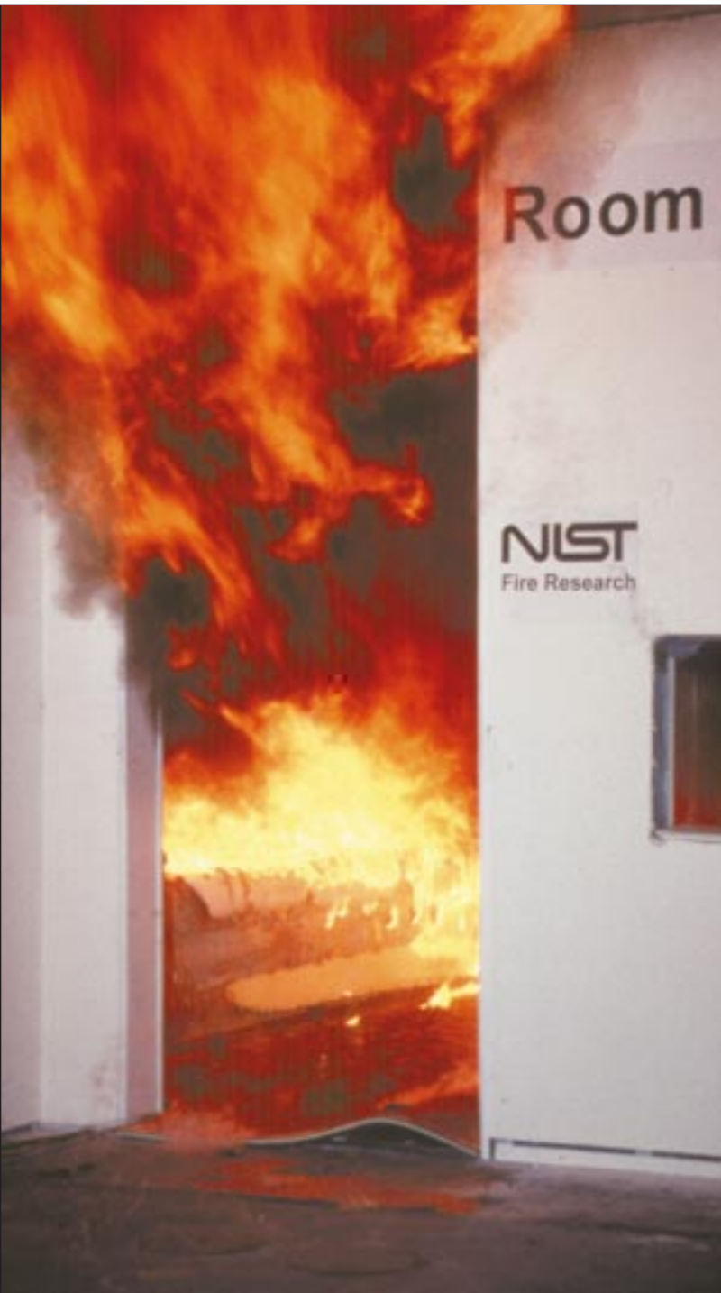
Part of a series of flashover fire tests conducted by NIST.

As the legal climate for arson and fire investigations becomes more demanding, their need for a rigorous scientific foundation is growing. Fortunately, federal research efforts are already starting to close the gap.