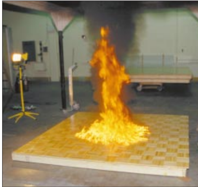
A parquet floor burns during the NIST liquid fuel spill burn pattern study.

A standardized, state-of-the-art fire investigation training package was the goal of the public-private partnership that developed interFIRE VR. The ATF spearheaded the partnership that included the USFA, the NFPA and American Re-Insurance Co. Experts from the International Association of Arson Investigators, the National Institute of Standards and Technology, and the law firm of Butler, Burnette and Pappas also contributed to developing the material for the training package. [Ed.: See "Desktop detective," July 1999, also avail-