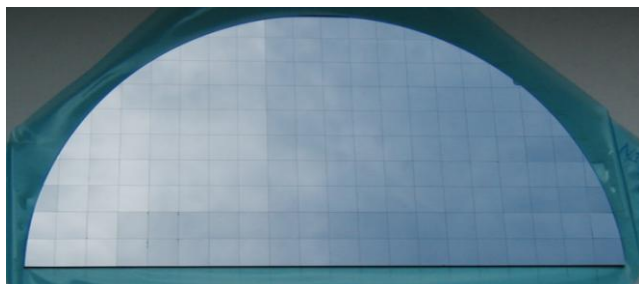
Image of half of one of the films on the 20 cm Si wafer that was cut into 1 cm x 1 cm sections.