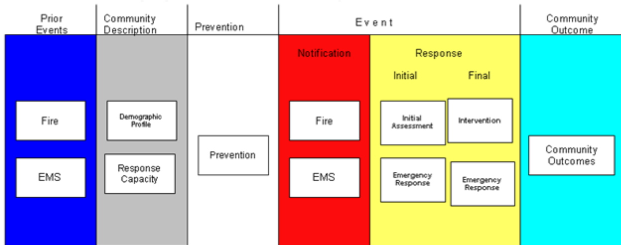
FIGURE 1: PROPAGATION OF COMMUNITY RISK

A critical step in this project was to create a community risk model that showed both the key elements of community risk and how they related to one another. The model shown in figure XX was developed, the elements of which are described below.