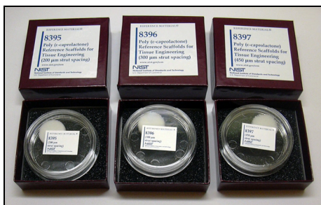
Fig. 1. First generation NIST reference scaffolds currently available and characterized for structure (strut diameter, strut spacing, porosity).

Statement of Purpose: Reference scaffolds characterized for cell response are being developed for use as a standard for biological characterization of new scaffolds. The need for reference scaffolds to serve as a calibration standard between labs has been identified as critical to advancing tissue engineering science [1,2]. The “Regenerative Medicine Promotion Act” was recently introduced into the U.S. House of Representatives which specifically calls for NIST to develop standards for regenerative medicine products [3]. Previously, NIST deployed reference scaffolds with well-characterized structure and porosity (Fig. 1) [4]. The current effort expands the scope to include cell culture data for morphology, attachment and proliferation. Freeform fabrication (FFF) was chosen to make the reference scaffolds since this technique affords precise control of scaffold structure. Poly( \epsilon -caprolactone) (PCL) was chosen as the polymer since it is used in biomedical implants and is being investigated for tissue scaffold applications. MC3T3-E1 osteoblasts were used for cell response since scaffolds are frequently used for bone tissue engineering. 96-well plate scaffolds were selected for efficiency (fewer reagents, lower cost).