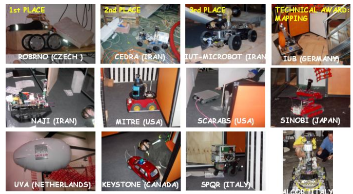
Figure 6: Robots from RoboCup2003 Rescue

The RoboCup2003 Rescue Robot League competition hosted twelve teams that demonstrated robotic systems with very diverse characteristics (Figure 6). The first place award winner was the ROBRNO team from Brno University of Technology in the Czech Republic [12]. They developed a very capable custom robot and integrated several components to form an extremely effective operator interface. Their robustly fabricated four-wheel, skid-steered robot was equipped with vision, infrared, and audio sensors for victim identification. The operator interface included a joystick to control robot motion along with heads-up display goggles that tracked the orientation of the operator's head to automatically point the robot's cameras. This allowed superior remote situational awareness and enabled the operator to negotiate narrow arena passages intuitively and dexterously, causing very few penalties.