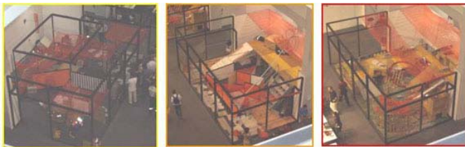
Figure 1: RoboCupRescue Robot League Arenas (yellow, orange, and red)

In 2003, competitions were held using existing and newly constructed arenas. For example, the first RoboCupRescue Japan Open competition was held in arenas fabricated for last year's RoboCupRescue2002 competition in Fukuoka, Japan [8]. A new orange arena was fabricated at Carnegie Mellon University and used to host demonstrations at the first RoboCupRescue U.S. Open. It will be used to support year-round robotics research. Also, new Italian arenas were fabricated for the RoboCupRescue2003 competition in Padua, Italy (Figure 1). These arenas will reside year round at the Istituto Superiori Antincendi in Rome, a fire-rescue training facility, and will support European robotics research. They may even host an Italian Open event next year.