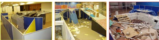
Figure 2: AAI Mobile Robot Rescue Competition Arenas (yellow, orange, and red)

The 2003 AAI competition continued to use the NIST transportable arenas to host the competition in Acapulco, Mexico (Figure 2).