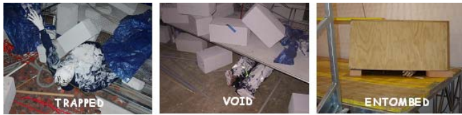
Figure 4: Other victim situations found in the arenas (trapped, void, and entombed)

statistics: surface (50 %), lightly trapped (30 %), void (15 %), or entombed (5 %) [9] (Figure 4).