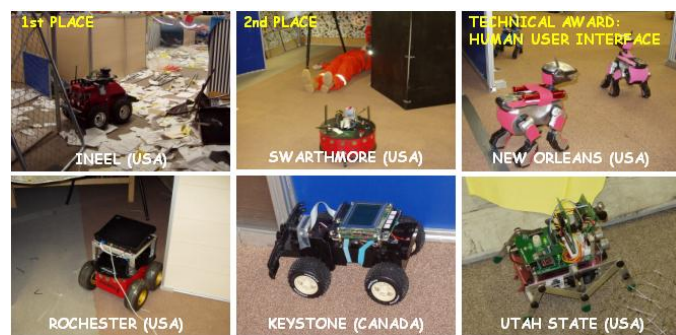
Figure 7: Robots from IJCAI/AAAI2003 Rescue

Other interesting approaches included fully autonomous robots, a robot almost directly from the mid-size soccer league, and even a blimp. The two fully autonomous teams demonstrated robots capable of navigating parts of the yellow arena but did not produce maps showing victim identifications, another key performance criteria, so these systems did not score well. The remotely teleoperated teams showed few autonomous behaviors to assist their operator's efforts, although several teams were working toward such capabilities. Most teams used wireless communications between the robots and their operator station, while a few teams used fixed tethers with varying levels of success due to snagging obstacles in the environment.