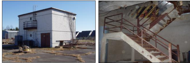
Figure 9: Reality Arena (above, below ground images)

Originally an underground missile silo, and more recently a stairwell burn-facility, the new “reality” arena (also known as the black arena) has been converted into a hardened, difficult, robot test facility that is safe for researchers and robots alike (see Figure 9).