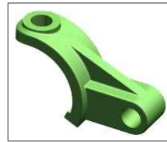
Fig. 1. Example product (bracket)

The hasAttribute relation is used to interpret the role played by single Objects as attributes for describing another Object . Specific sub-properties such as hasFunction , hasForm and hasConstraint are created to define explicit relationships between various Objects . Each of