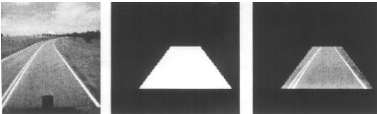
Figure 3. Road Scene, Window of Interest, Masked Road Scene.

Figure 3 shows the various scenes obtained when applying a window of interest to the road scene. The lateral position of the window of interest shifts in order to keep it centered on the road and its shape changes as a function of the predicted road curvature.