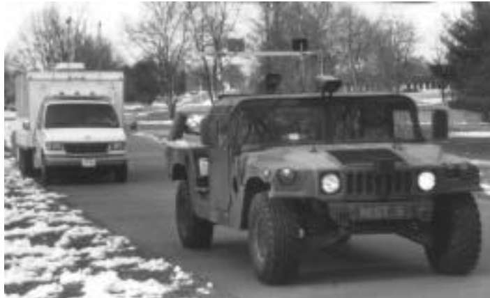
Figure 1. Testbed vehicle followed by support van

The unmanned vehicle, a HMMWV, was actuated by NIST, ARL and the Tooele Army Depot as part of the DOD's Unmanned Ground Vehicles program [1,2]. Figure 1 is a photograph of the testbed vehicle. The vehicle contains electric motors for steering, brake, throttle, transmission, transfer case, and park brake and sensors to monitor the dashboard gauges indicating speed, RPM, and temperature.